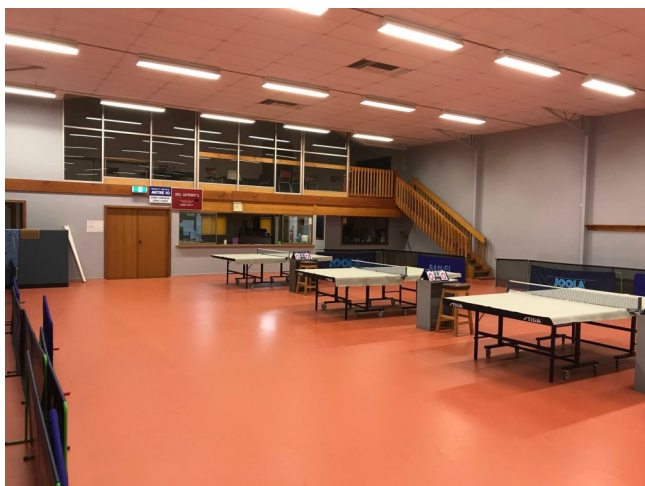
Port Lincoln Table Tennis Club

On the final leg of the country affiliate trip, visiting Whyalla and Port Lincoln. Met with key Committee members at each location engaging in informative conversation. Funding opportunities (direct and indirect) again attracted meaningful discussion. Both affiliates had needs of which TTSA was not previously aware / had not been communicated to TTSA.