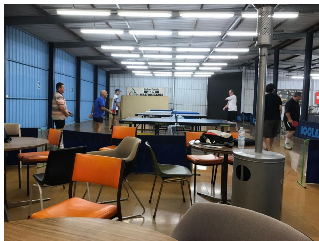
Port Pirie Table Tennis Club

Caught up with Port Pirie late yesterday afternoon prior to competition. Very warm days certainly impact tin shed stadiums, but a temporary a/c solution provided some relief when off court.