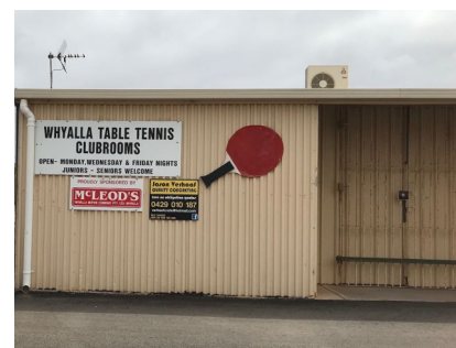
Whyalla Table Tennis Club

Both affiliates thought the visit was timely to enabling a follow up prior to their 2018 competition season kicking off. Learnt of the many small town table tennis groups operating, much more than I ever thought. Certainly some follow up opportunities exist. Catching up with Port Pirie on the way home. Its been a great trip and certainly worthwhile.